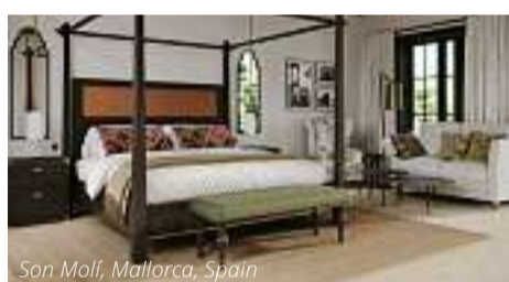
Son Moli, Mallorca, Spain

Another Mediterranean escape is Villa La Guttière, Hotel du Cap-Eden-Roc's nine-bedroom villa opening early 2025, and the 19-room expansion of Kalesma Mykonos, Greece. Opening this spring, Casina Cinquepozzi is an exclusive-use 18th-century Manor House set on a 40-acre estate in Putignano, Puglia, and in the Tuscan region of the Maremma is Villa La Vedetta, part of Castello di Vicarelo.