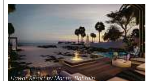
Hawar Resort by Mantis, Bahrain

In Thailand, Capella Bangkok has combined sports and leisure with its new immersive bike tour, 'One Road, Two Wheels'. Alternatively, given people watching is a great sport in hotels, Four Seasons Resort Koh Samui and the Tourism Authority of Thailand have partnered with HBO to support the filming and promotion of the highly anticipated third season of 'The White Lotus', set to air in 2025 and shot in locations across Thailand.