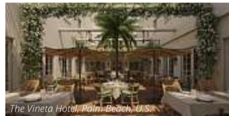
The Vineta Hotel, Palm Beach, U.S.

For travelers seeking exotic destinations, the JW Marriott Kaafu Atoll Island Resort in Maldives and The St. Regis Aruba Resort in the Caribbean open in January while February sees Marriott's Sallerra, a Luxury Collection Resort & Spa, Turks & Caicos open, offering unspoiled nature and a rich cultural heritage.