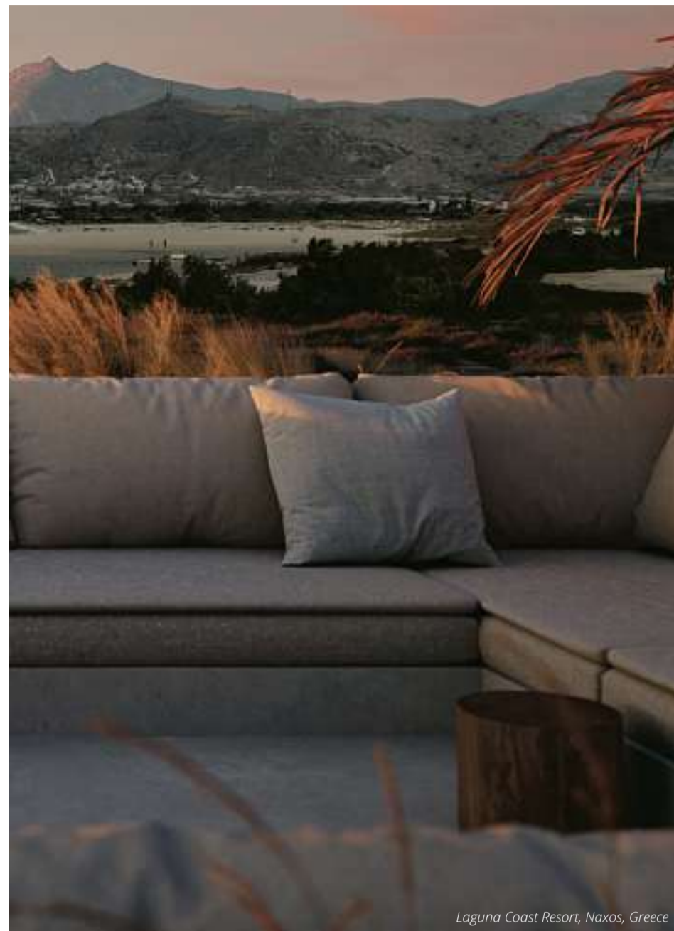
Laguna Coast Resort, Naxos, Greece

However if you plan to stay in the U.S. then The Cooper opens in Charleston, South Carolina and Thompson Miami Beach launches reimagined luxury in Florida.