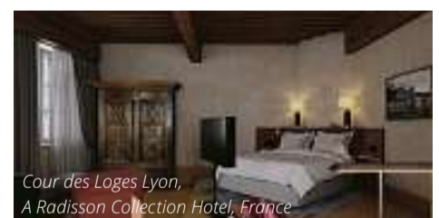
Cour des Loges Lyon, A Radisson Collection Hotel, France

The end of 2024 and the beginning of the New Year saw a stream of innovative openings and refurbishments from major brands as well as independents. In December, Jumeirah announced two new openings marking its entry into Africa: Jumeirah Thanda Island in Tanzania, and Jumeirah Thanda Safari in South Africa, situated in one of the most exclusive Big Five private game reserves in South Africa. Alongside conservation and community, small is beautiful is another key mantra for the year ahead and, in Italy, the Bianca Relais, a 10-room boutique gem, reopens imminently under R Collection management, overlooking Lake Annone. City hotels continue to thrive with Casa Brera, a Luxury Collection Hotel, Milan, Marriott's 101-room hotel, opening in the buzziest quarter of Milan. In France, the Cour des Loges re-opened in Lyon attracting all manner of foodies to its Michelin-starred restaurant. In London, The Welbeck Hotel opens in February in the heart of the vibrant urban district of Marylebone. The Park Lane Copenhagen is the city's luxury destination, after undergoing a stunning transformation. In February, The Langham in Pasadena, Los Angeles will undergo an extensive renovation designed to enrich its historic grandeur with an infusion of contemporary elements.