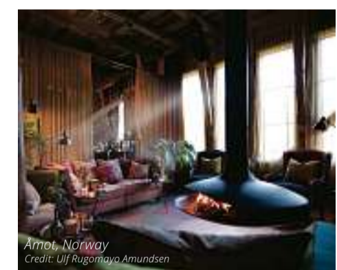
Aman, Norway