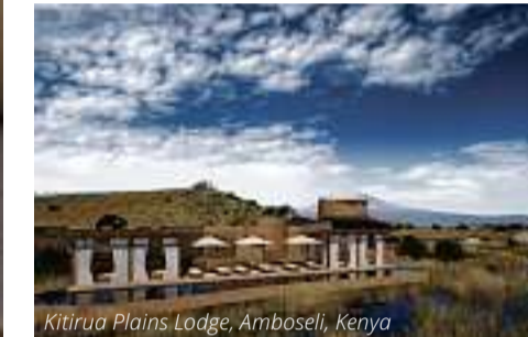
Kitirua Plains Lodge, Amboseli, Kenya

For the even more adventurous, opening in Puerto Williams, Chile, is the world's most southernmost hotel, transforming the Silversea Antarctica cruise expedition experience by facilitating the journey from the sub-Antarctic zone of Patagonian Chile to the White Continent. Not quite as starkly remote, the brand behind NIHI Sumba, sees the much-anticipated opening of NIHI Rote on West Timor, Indonesia. And A&K launches its flagship lodge Kitirua Plains Lodge, in Amboseli National Park, from where you can witness the majesty of Mount Kilimanjaro and immerse yourself in the heart of Kenya's wildlife-rich savanna—all coinciding with the 40th anniversary of the film Out of Africa.