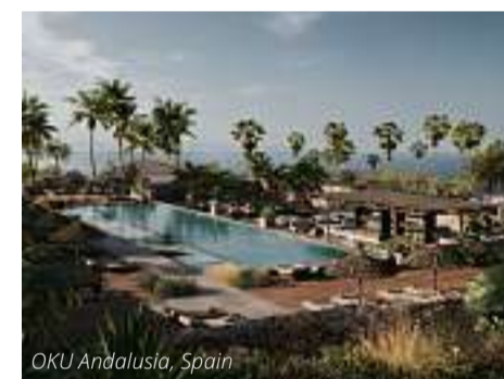
OKU Andalucia, Spain