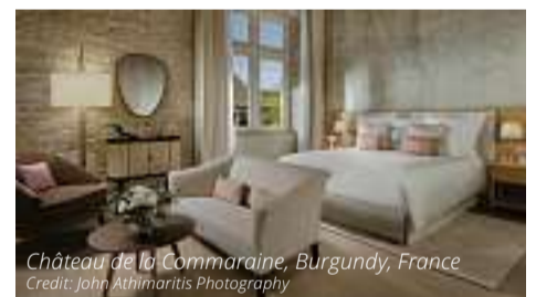
Château de la Commarie, Burgundy, France

If whisky is your tippie, Ardberg House was recently purchased by LVMH near the distillery where Ardberg has been creating its untamed smoky whisky for more than 200 years on the remote Scottish island of Islay.