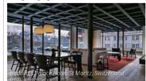
Spa at the Palace Hotel, St Moritz, Switzerland

From September 2025, AlUla's The Chedi Hagra, a Saudi Arabian desert retreat, offers exclusive access to events including the Richard Mille AlUla Desert Polo. Regent Seven Seas Cruises has announced the launch of its 'Spotlight Voyage on Golf' experience, offering exclusive access to top golf courses across the British Isles with golfing legend Annika Sörenstam.